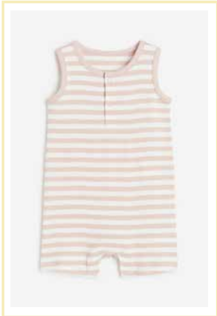
KKM-NB-1008 romper single jersey, yarn dyed