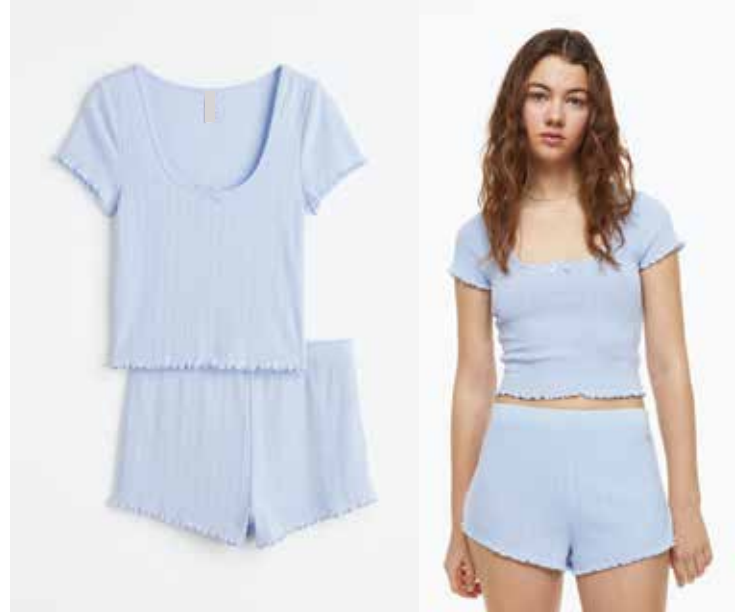
KKM-ISO-1003 Pointelle Jersey- Pyjama 97% Recycled Polyester, 3% Elastane

Recycled cotton is cotton made from textile waste in production or from end-of-life textile waste.