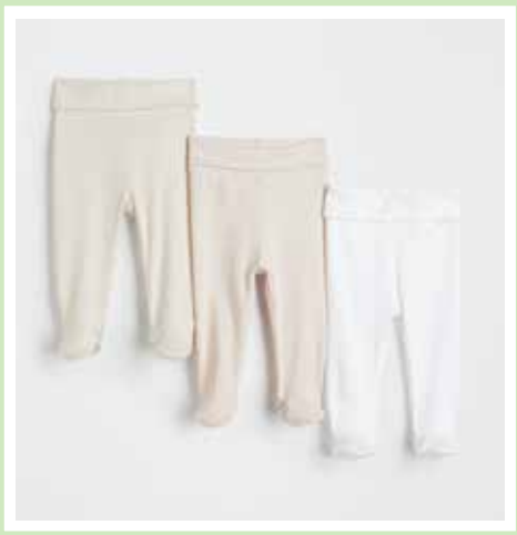
KKM-NB-1002 knit pant interlock