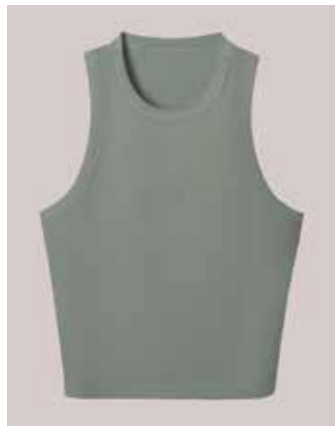
KKM-LOG-1005 tank top interlock, solid