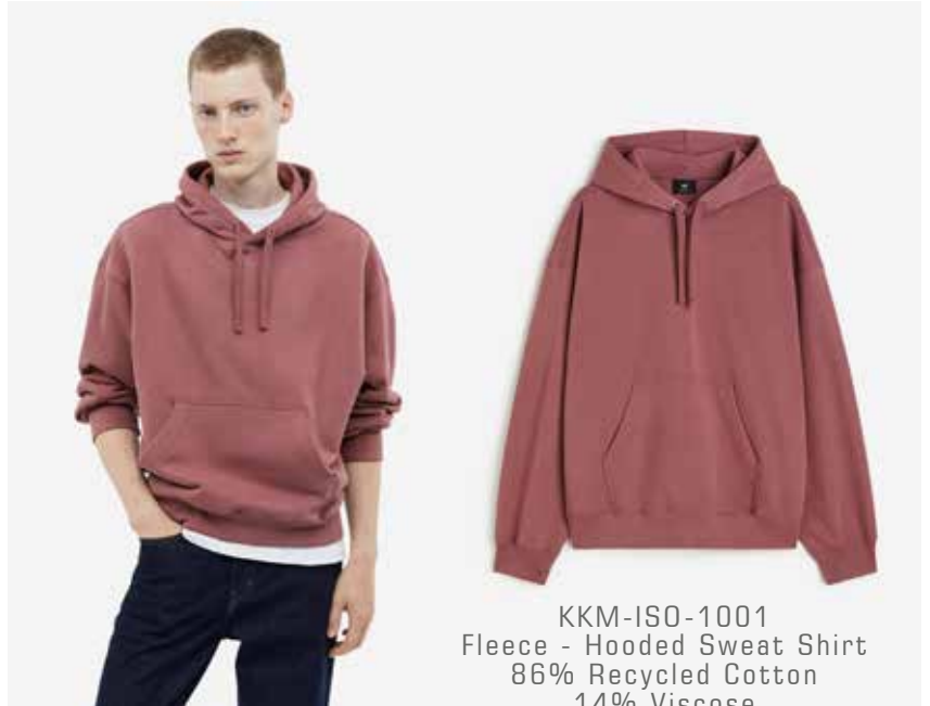
KKM-ISO-1001 Fleece - Hooded Sweat Shirt 86% Recycled Cotton 14% Viscose