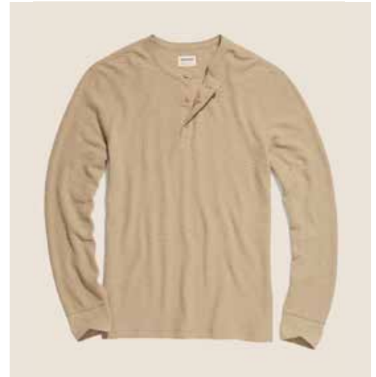
KKM-MEN-1010 henley tees light weight mini waffle