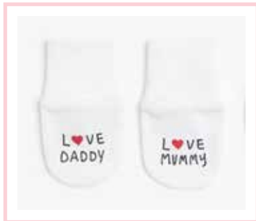
KKM-NB-1004 mitten single jersey, embroidery