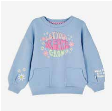
KKM-GRL-1008 sweat shirt french terry, puff print