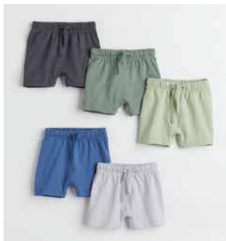
KKM-BOY-1006 shorts single jersey, solid