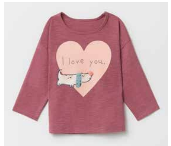
KKM-GRL-1007 long sleeve t-shirt slub jersey, garment dyed