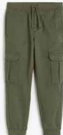
KKM-ISO-1010 Interlock - T-shirt & Pant 100% Cotton, 5% Elastane