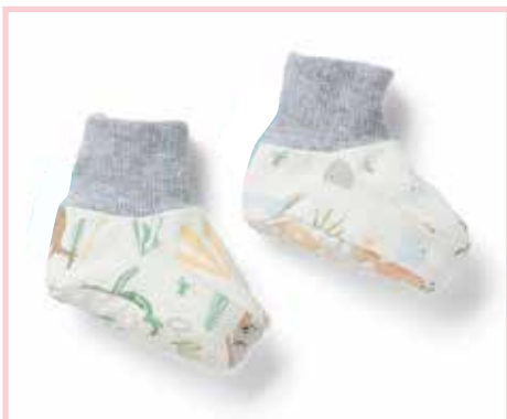
KKM-NB-1010 booties single jersey & rib, aop