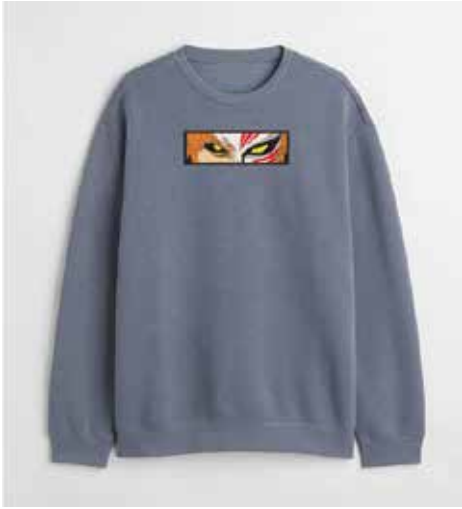
KKM-MEN-1007 fleece sweat shirt with chest artwork