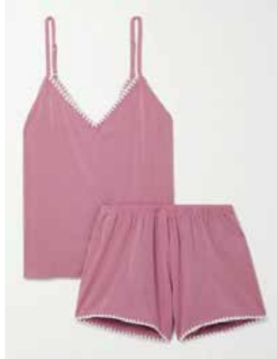
KKM-LOG-1008 nightwear (slip/shorts) single jersey