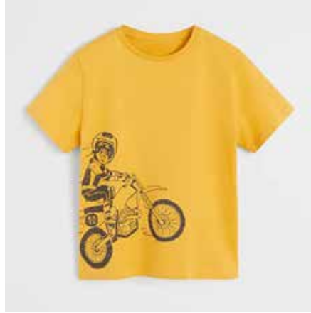
KKM-BOY-1009 t-shirt single jersey, placement print