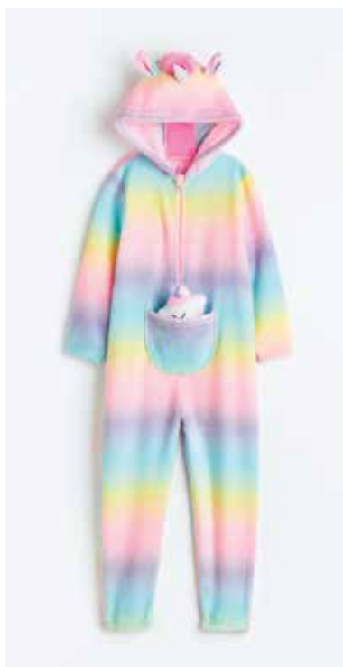
KKM-GRL-1015 jumpsuit french terry, tie dye