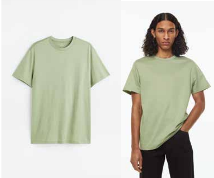
KKM-ISO-1002 Single Jersey- Tshirt 60% Cotton, 40% Polyester Natural Dyed