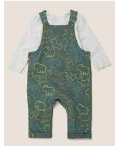
KKM-BOY-1012 dungaree & tshirt aop, gray melange