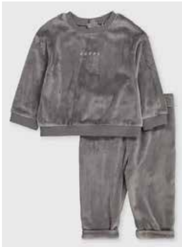
KKM-BOY-1010 weat shirt & pant matte velvet jersey