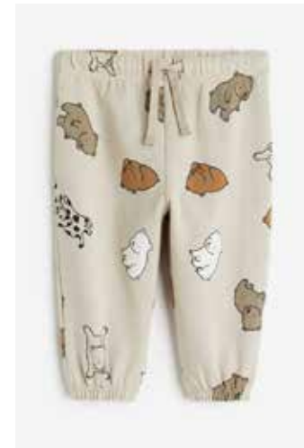
KKM-BOY-1004 knit pant interlock, aop