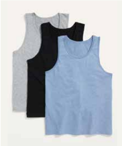
KKM-LOG-1002 tank top slub jersey