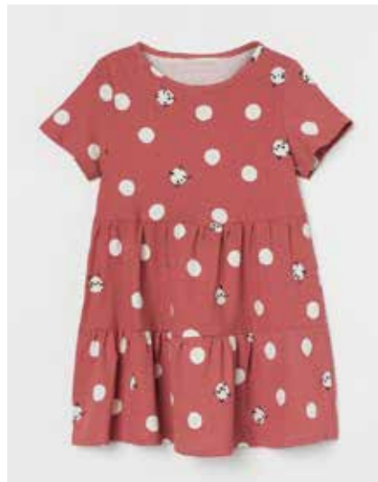
KKM-GRL-1011 dress slub jersey, aop