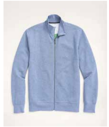
KKM-MEN-1009 jacket french terry, heather