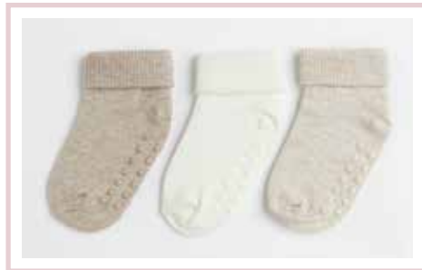
KKM-NB-1009 socks bamboo & Spandex