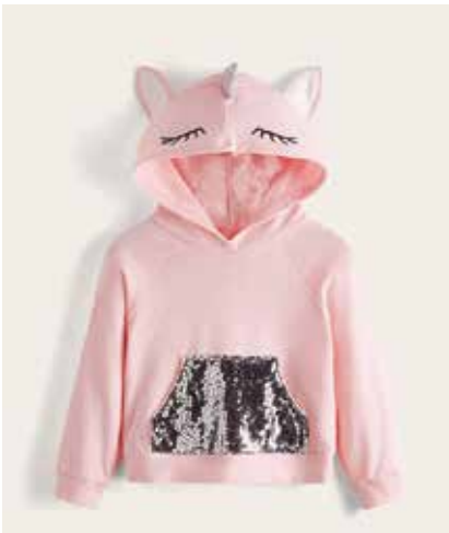
KKM-GRL-1002 hoodie sequence details