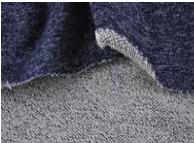
FB10-Micro or baby terry