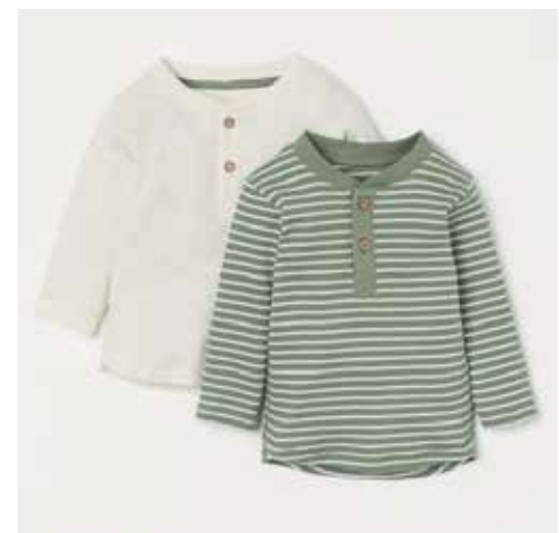
KKM-BOY-1007 henley t-shirt single jersey, yarn dyed