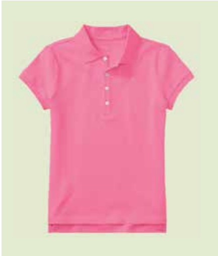
KKM-WOM-1007 polo shirt pique, solid