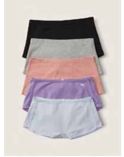
KKM-LOG-1009 panties micro modal cotton panties