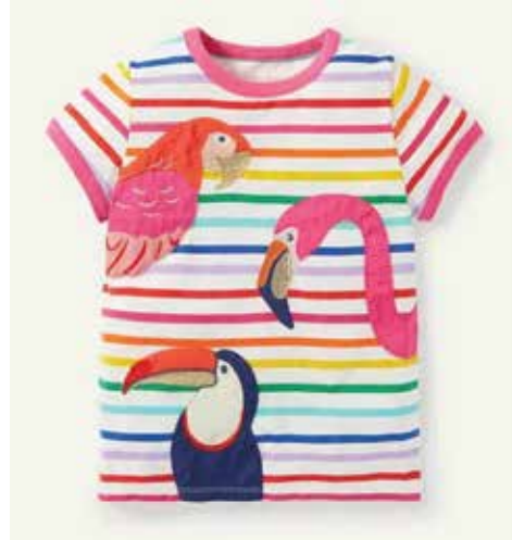
KKM-GRL-1001 t-shirt-single jersey aop/embroidery/patch work