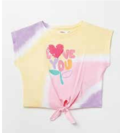
KKM-GRL-1009 crop top single jersey, tie dye