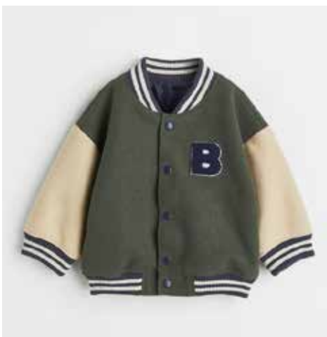
KKM-BOY-1005 cardigan fleece, rib details