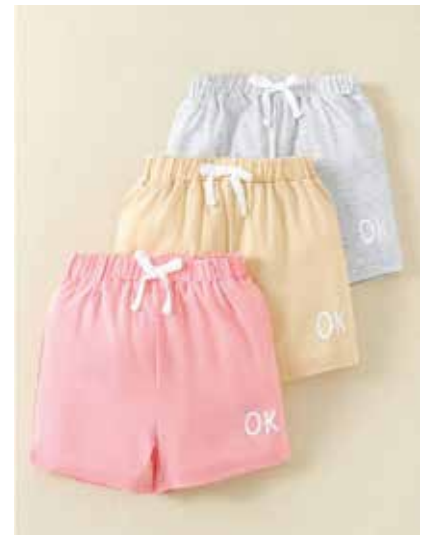
KKM-GRL-1012 shorts single jersey, garment dyed