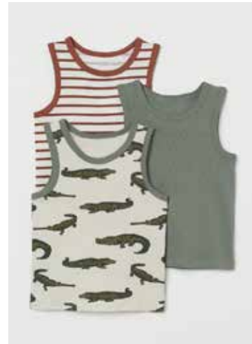
KKM-BOY-1003 vest interlock, aop & solid