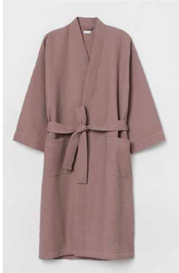
KKM-LOG-1006 dressing gown waffled, waist tie