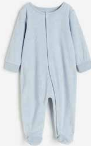
KKM-ISO-1007 Fleece - Sleepsuit 20% Organic Cotton, 80% Recycled Polyester