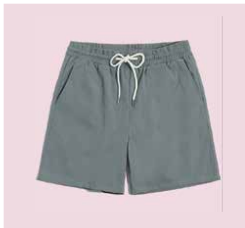
KKM-MEN-1005 shorts interlock, solid