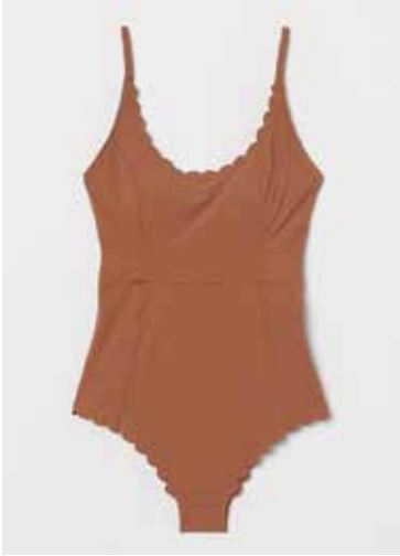
KKM-LOG-1007 bodysuit-swimwear spandex