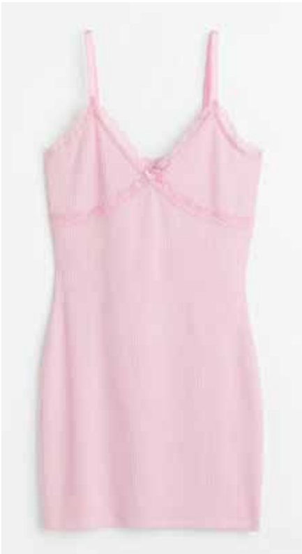
KKM-LOG-1012 night dress rib, lace details