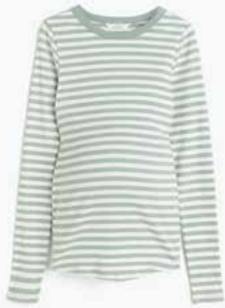
KKM-ISO-1004 Rib - Maternity T-shirt 95% Cotton, 5% Elastane