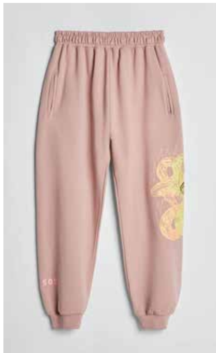
KKM-WOM-1010 sweat pant french terry, print details