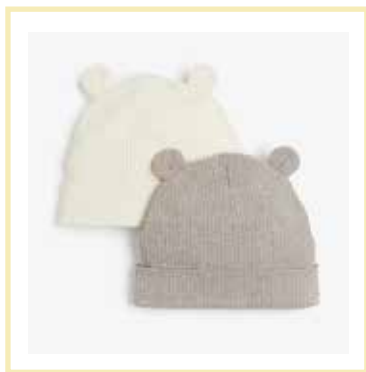
KKM-NB-1003 hat rib, ear details