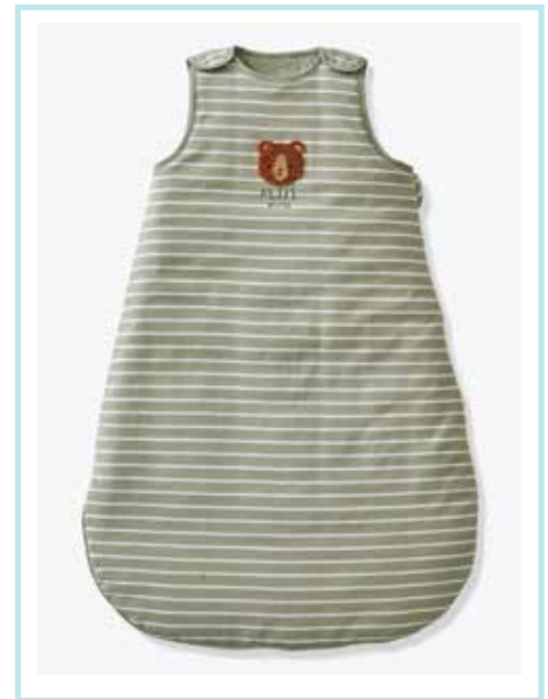
KKM-NB-1011 sleep bag single jersey, embroidery