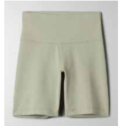
KKM-LOG-1011 tights single jersey, spandex