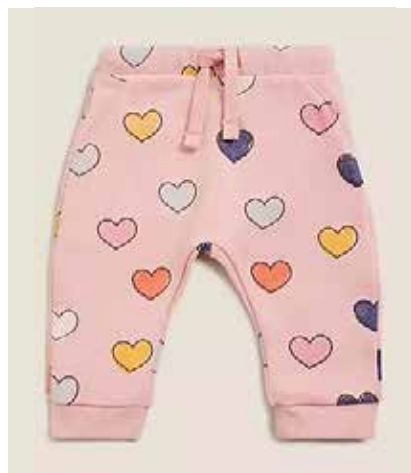
KKM-GRL-1006 pant interlock, aop