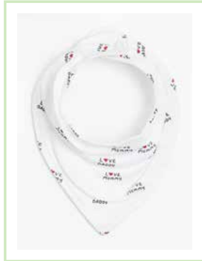
KKM-NB-1007 bib single jersey, aop