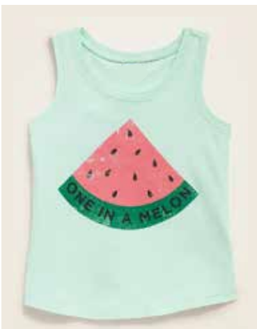
KKM-GRL-1005 vest single jersey, print