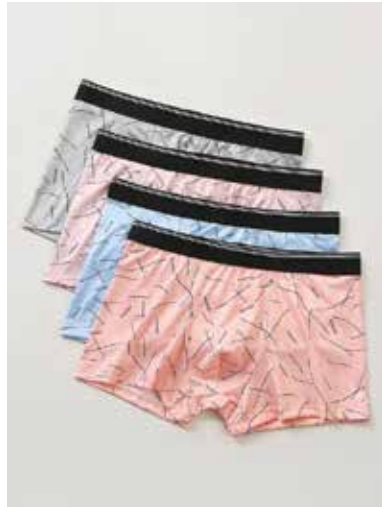
KKM-LOG-1003 trunks single jersey, outer elastic