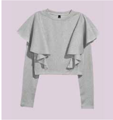
KKM-WOM-1008 fashion crop top lurex stretch jersey