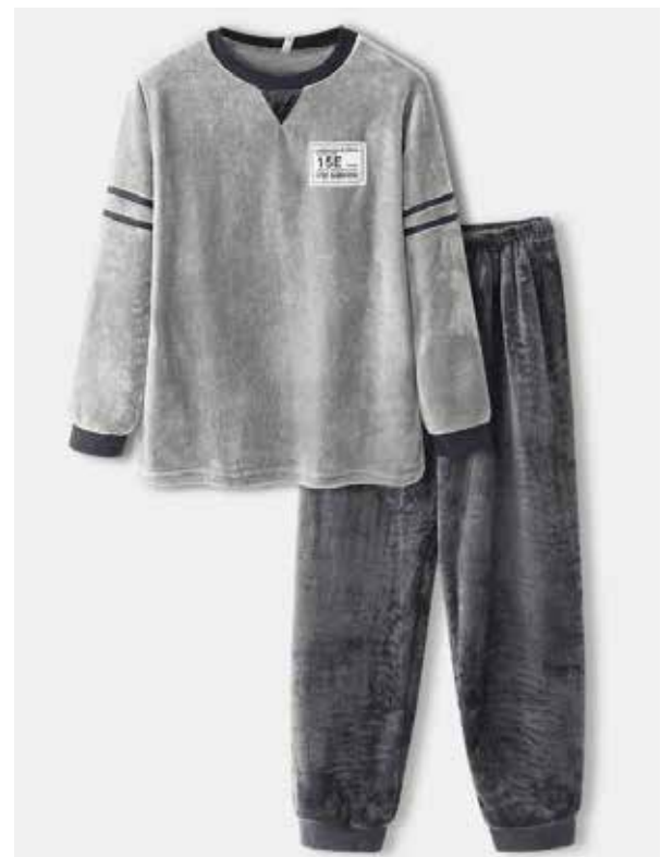
KKM-MEN-1006 pullover tees & sweat pant velour, cut & sew