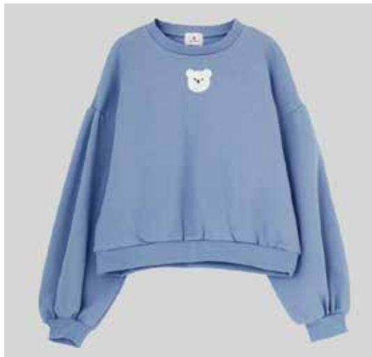
KKM-WOM-1009 sweat shirt fleece, embroidery @ chest