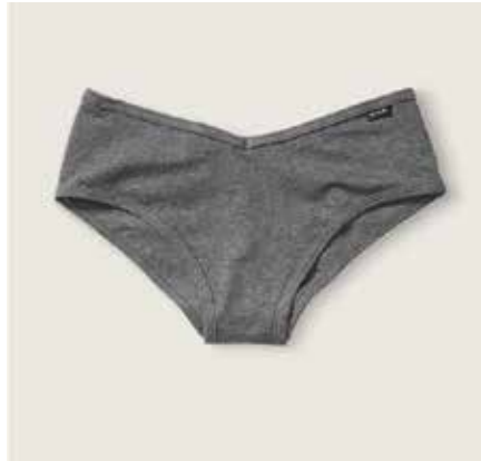
KKM-LOG-1010 cheekster single jersey, melange