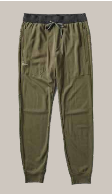
KKM-MEN-1011 jogger interlock, zip pocket