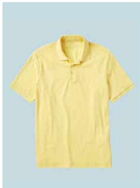
KKM-MEN-1012 polo shirt supima cotton pique