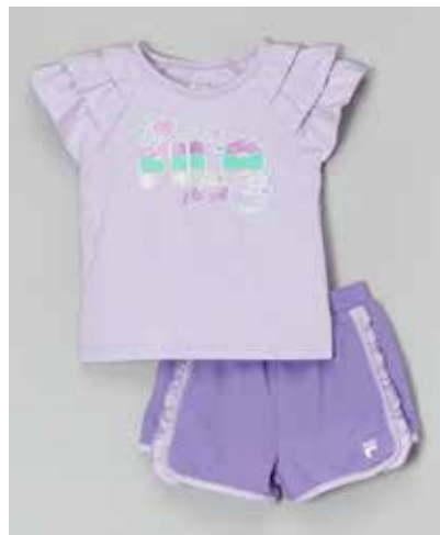
KKM-GRL-1003 ruffle tees & shorts french terry, cut & sew