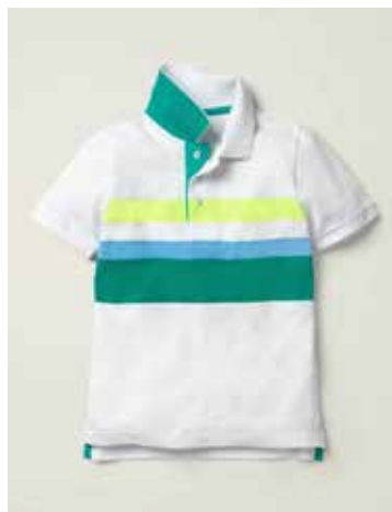
KKM-BOY-1014 polo shirt pique, engineer stripe