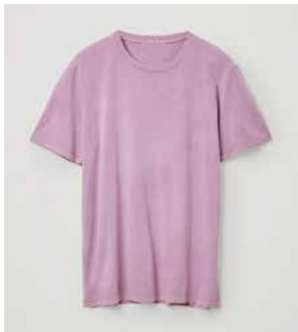
KKM-MEN-1002 t-shirt single jersey