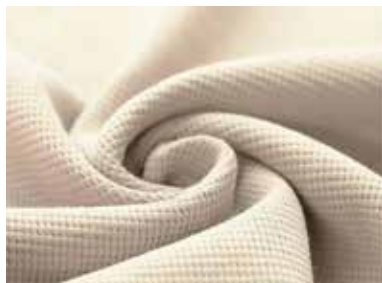
FB14-waffle or thermal knit