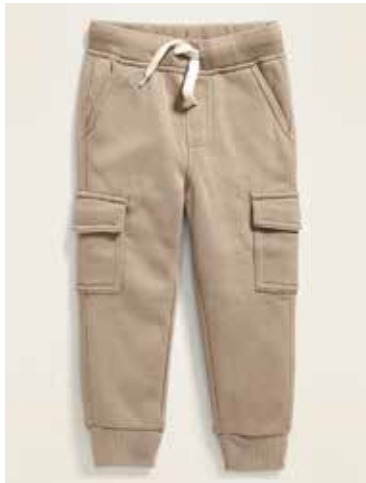
KKM-BOY-1013 jogger french terry, solid