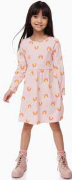
KKM-ISO-1006 Slub Jersey - Girl Dress 97% Recycled Cotton, 3% Elastane