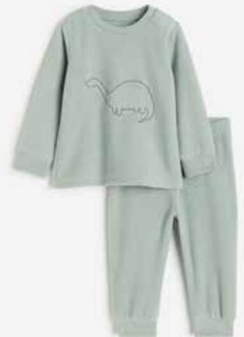
KKM-ISO-1008 French Terry - Set 78% Organic Cotton, 22% Recycled Polyester