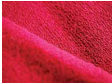
FB11-French terry (inside brushed)