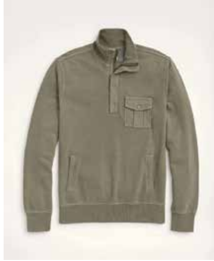
KKM-MEN-1008 q-zip pullover french terry, garment dye