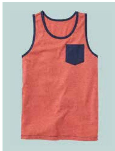
KKM-MEN-1003 vest slub jersey, pocket