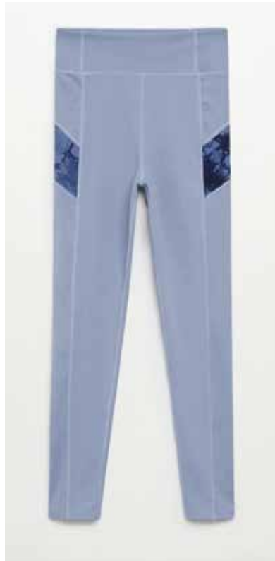
KKM-LOG-1013 yoga pant supima cotton spandex