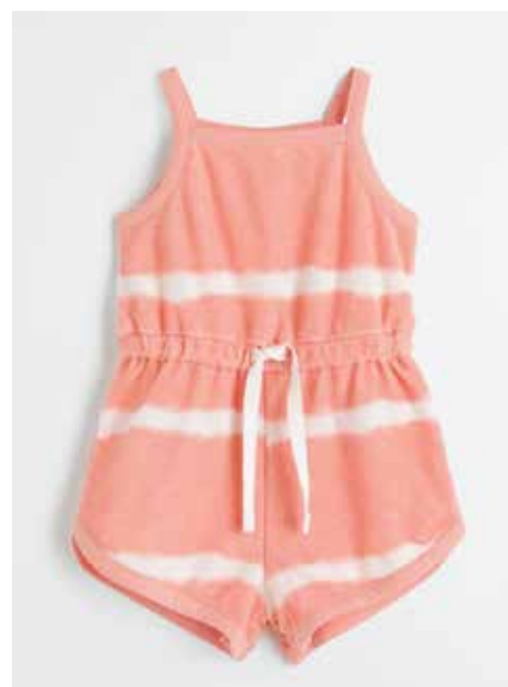
KKM-GRL-1013 romper interlock, tie dye