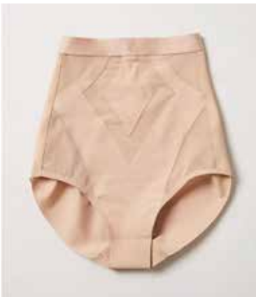
KKM-LOG-1004 shape wear nylon