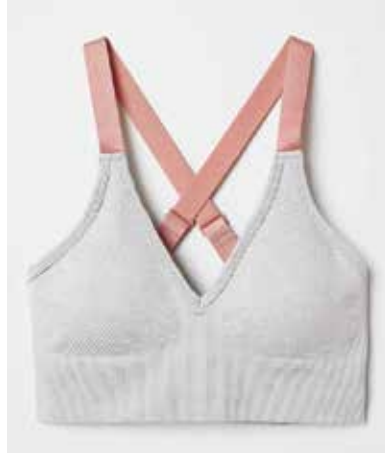
KKM-LOG-1001 sports bra rib, adjustable strap