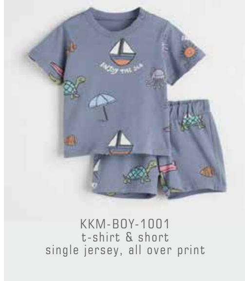
KKM-BOY-1001 t-shirt & short single jersey, all over print