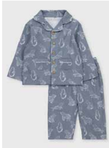
KKM-BOY-1011 pajama set all over print