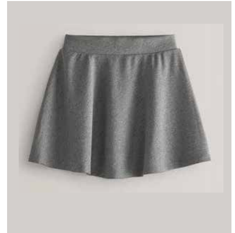
KKM-GRL-1010 skirt charcoal melange, solid