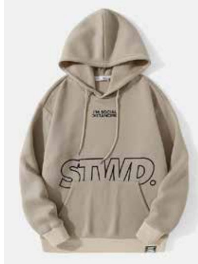
KKM-MEN-1001 hoodie fleece, pocket details