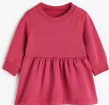
IKKM-ISO-1009 Interlock - Baby Dress 95% Pima Cotton, 5% Elastane Natural Dyed