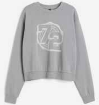
KKM-ISO-1005 French Terry - Sweat Shirt 62% Cotton, 38% Polyester