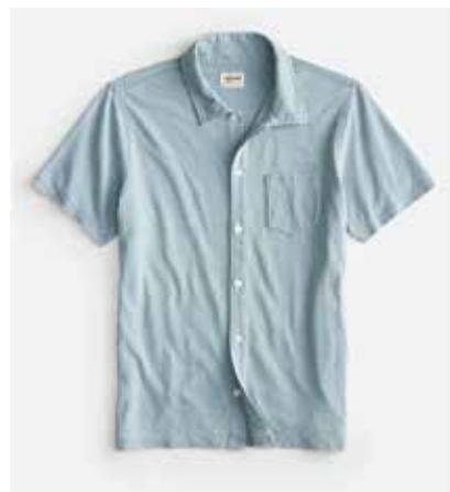
KKM-MEN-1004 jersey shirt indigo-heavy bleached