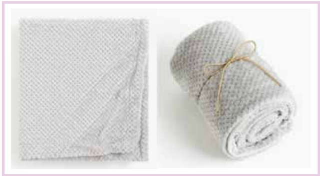
KKM-NB-1006 blanket fleece, 2 way usable