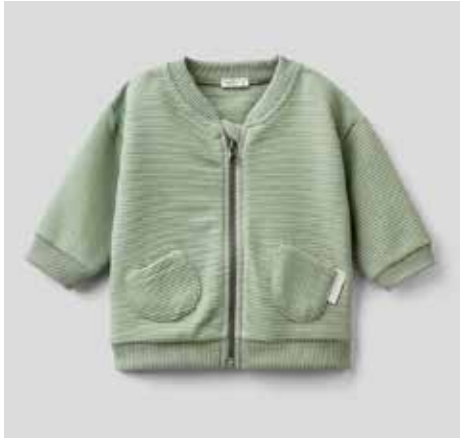
KKM-BOY-1008 Jacket rib, garment dyed