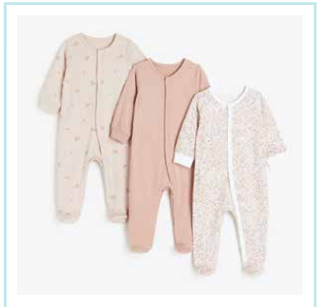
KKM-NB-1005 sleepsuit interlock, front full open